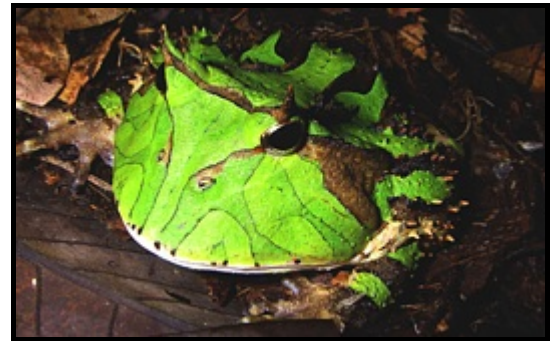
AMAZONIAN HORNED FROG Ceratophrys cornuta