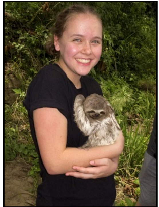
Making new friends.

November 8, Friday - Day 6 - Ceiba Tops Lodge - Iquitos A morning walk in the beautiful primary rainforest reserve around Ceiba Tops including a visit to the huge Ceiba Tree for which the lodge is named. Afternoon return to Iquitos and transfer to the Garden House Hotel. Iquitos is loaded with interesting sites, shops are filled with handicrafts, beautiful hand-painted or woven textiles, exquisite pottery, hammocks, and the like. This evening dinner is NOT included in the price, but we will all gather for dinner at one of the many colorful Iquitos restaurants, after which we can enjoy the fun Iquitos nightlife. Overnight at Garden House Hotel. (Breakfast, Lunch)