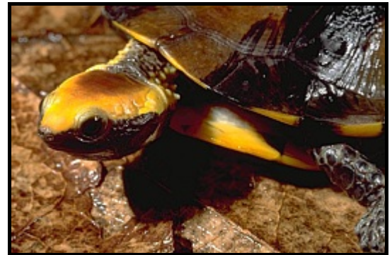
WESTERN TWIST-NECKED TURTLE Platemys platycephala melanonota