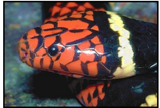
AQUATIC CORALSLNAKE Micrurus surinamensis

Morning hike to another lodge and the Canopy Walkway, a suspended bridge spanning 500 meters, connected by tree platforms and reaching a height of over 115 feet above the forest floor. Even if the herping at our first stop is good enough for a prolonged stay, we'll take a morning to visit the Canopy Walkway. Here there is time to observe a part of the rainforest rarely seen by man but accessible without any type of climbing skill or equipment. We'll store most of our gear at the main lodge and carry daypacks (assistance available if needed). Later in the afternoon we may hike along the Medicinal and Useful Plant Trail where your guide will point out the way that many of the plants, seen here growing in primary forest, are used by local residents in the construction of their homes, canoes and tools as well as describe some of their medicinal properties. If we