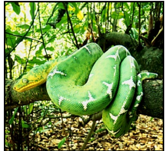
EMERALD TREEBOA Corallus batesi