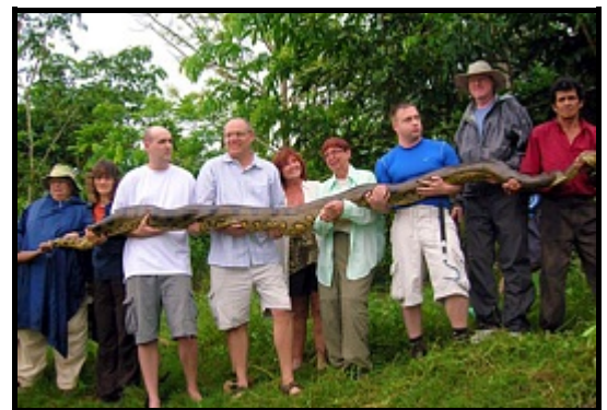
COMMON ANACONDA Eunectes murinus