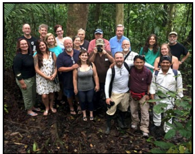
Our 2018 Herping Group

Finding Reptiles & Amphibians in the rainforest is just like fishing in the sense that one location can be more productive than another. Drawing upon years of experience and counting, as one always must do, on luck and the weather, we go to places where currently good herping can be found. Success goes hand-in-hand with flexibility: depending on our experience in the immediate area, we may opt to remain there for more time, or we may shift to another spot. We stay adaptable and find the proof of our approach in the numbers of animals and species we encounter on our Herping Trips. What follows is a sample itinerary of just such a trip.