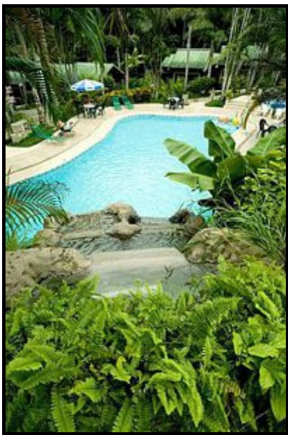
POOL AT CEIBA TOPS LODGE

If we are in the area, maybe an early morning pre-breakfast visit to the Canopy Walkway, the best time for bird watching. This invariably (except in the rain) yields closeup views of Amazon Thornytails ( Uracentron flaviceps ) which live in the canopy. Not only is this a fantastic lizard, but also it is one seen by few people owing to its canopy habitat. Usually it is possible to approach them closely. After breakfast you will walk the trail out and board boats for the trip to our next lodge....Ceiba Tops. On the way you will pass the town of Francisco de Orellana, where a statue