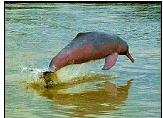
AMAZON RIVER DOLPHIN Inia geoffrensis

Afternoon open boat excursion along the Amazon in search of either of the two species of freshwater dolphin. Visit a Yagua indigenous village, where your guide will show you a way of village life where people's day-to-day activities depend on the mighty rivers surrounding them. Ceiba Tops has an extensive trail system that we will herp and it has yielded bushmasters, fer-de-lance, boa constrictors, Amazon